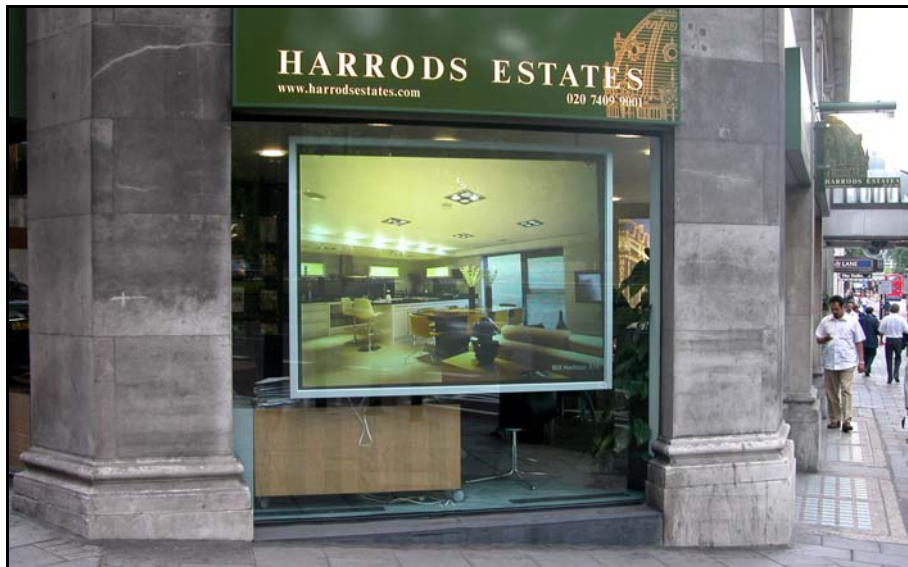
Harrods Estates, Park Lane

Harrods Estates asked Handy AV to modernise their window displays across all their branches. The flagship office located on Park Lane already had a 60" screen film applied to the window, but this was not providing the impact needed. As directed by the Chairman, Mr Al Fayed, they wanted a larger screen to carry their marketing message.